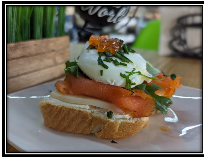
Greek Cuisine Serves5 $62.49 Gyro / Chicken Gyro + Salad or Fries